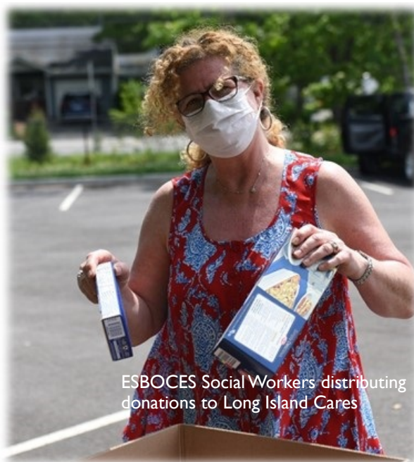
ESBOCES Social Workers distributing donations to Long Island Cares

This story about ES BOCES originally appeared on the NYSED website Staying Connected . Click this link to see more stories.