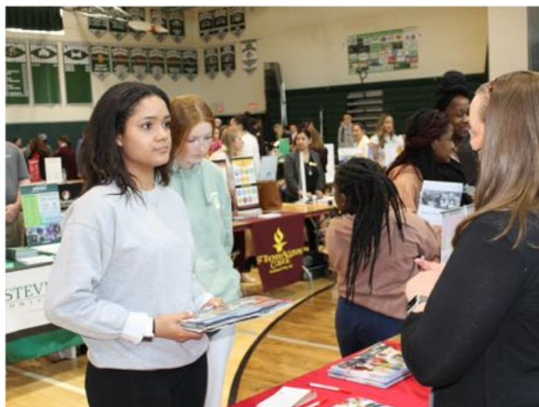
Students visiting with college representatives at last year's Spring College Fair.